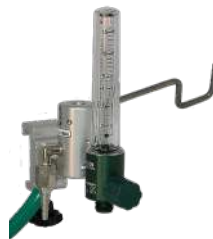
Oxygen Switch for AMBO