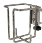
Distilled Water/Disinfection Liquid Holder