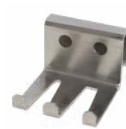
Suction Tube Management