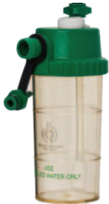
Humidifier* P.N - 4101100