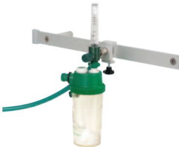
Rail Mounted Oxygen Unit