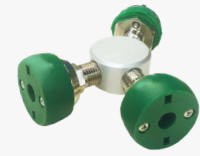
Diamond dual Y Oxygen outlets adapter