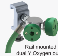
Rail mounted Diamond dual Y Oxygen outlets adapter