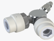
DIN dual Y Oxygen outlets adapter